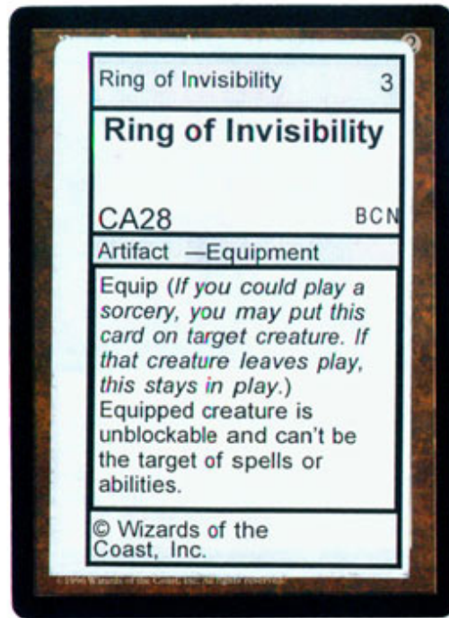
"Ring of Invisibility," the card that eventually became Whispersilk Cloak

During the dawn of Mirrodin design, equipment had some funny properties. First of all, the equip ability didn't have mana costs. It still could only be played during your turn, and only on an empty stack (in other words, only when you could play a sorcery), but all equipment essentially had Equip ①. But that's not as fun as it sounds.